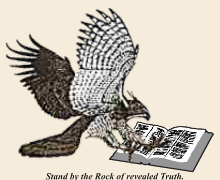
Stand by the Rock of revealed Truth It makes the difference! Matt. 16:15-18